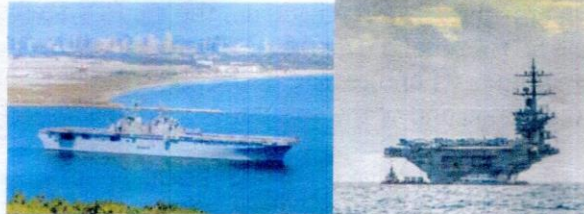
USS Essex (LHD 2) transits San Diego Bay while getting underway for sea trials on May 3.

U.S. Navy's Wasp-class multi-purpose amphibious assault ship USS Essex (LHD2) returned to sea on May 3 after completing her phased maintenance availability.